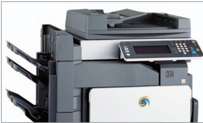
EMBEDDED FINISHER with stapler and additional bin