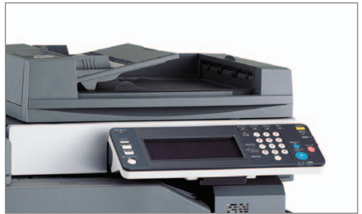
Ergonomic KEYBOARD with LCD display